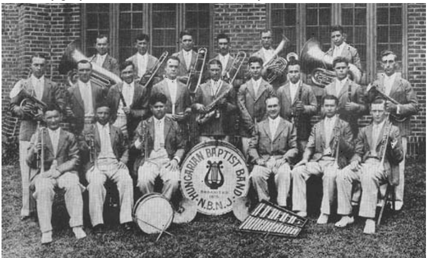
Hungarian Baptist Band of New Brunswick, NJ. 1935.

Children were taught to sing in Sunday School, then in Youth Choir,