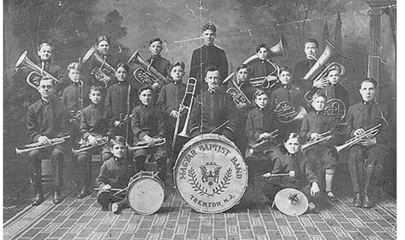
Boy's Band of the First Magyar Baptist Church of Trenton, NJ .

Another contributing factor was the migration to California in the 1940's. Almost every church lost families who moved there. The Buckeye Road Church and the Holton Avenue Church merged and moved to the Shaker Square area on 130th Street. But no more band. The West Side Church , too, lost its musicians so there was no more band there either.